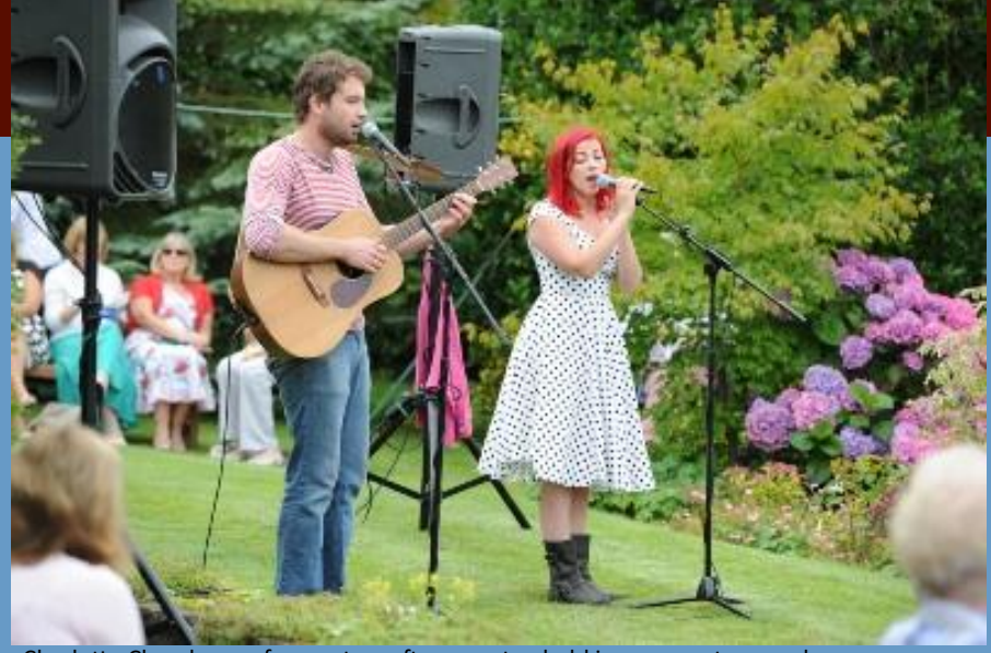
Charlotte Church sang for us at an afternoon tea held in a supporters garden